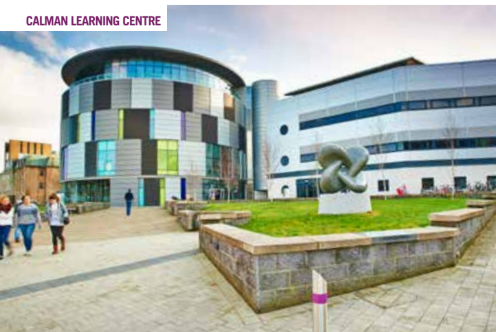
CALMAN LEARNING CENTRE