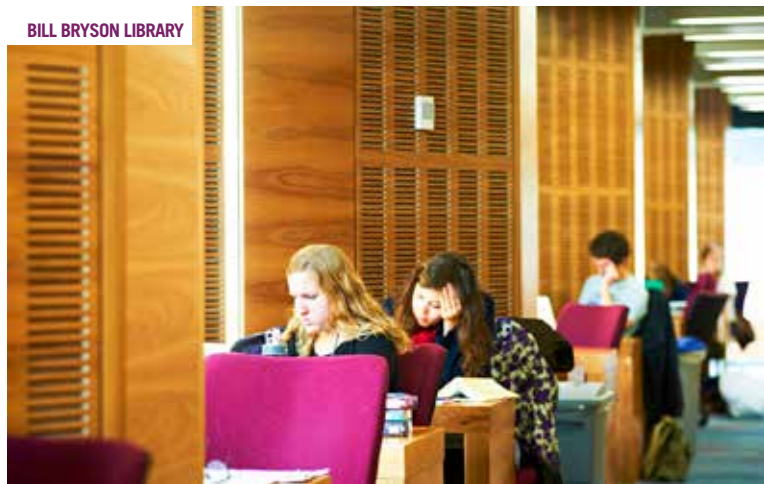
BILL BRYSON LIBRARY