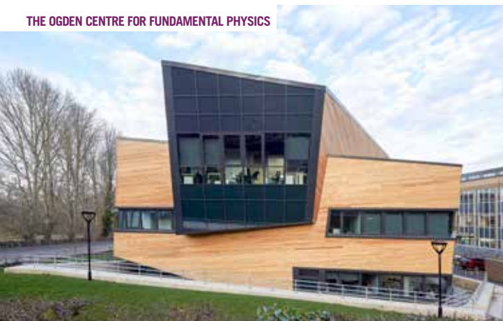
THE OGDEN CENTRE FOR FUNDAMENTAL PHYSICS