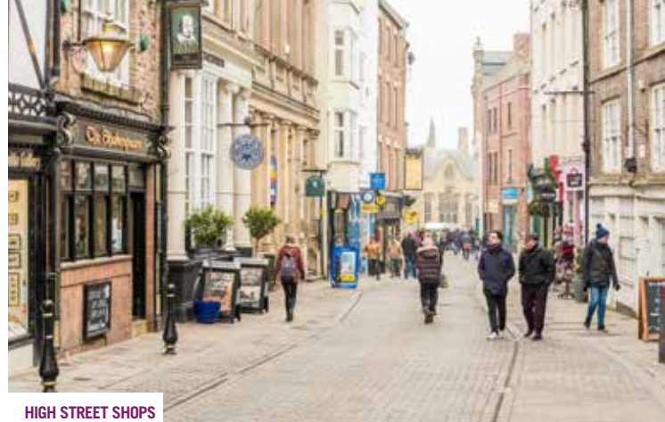
HIGH STREET SHOPS