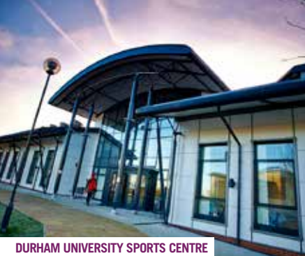
DURHAM UNIVERSITY SPORTS CENTRE